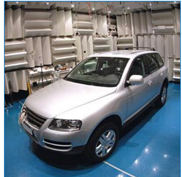
Vehicle Semi-Anechoic Chamber (V.S.A.C.) at Delphi Customer Technology Centre Luxembourg