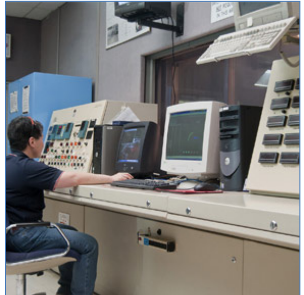
Control Room for the Environmental Vehicle Testing Laboratory at Delphi's Technical Center Rochester