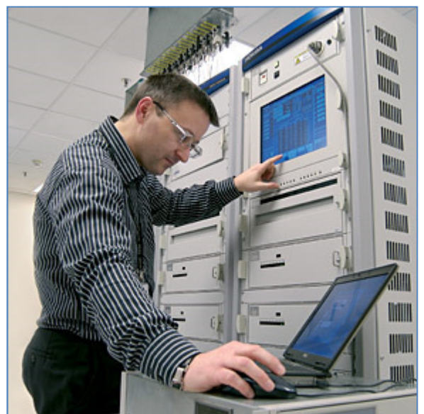
Modal Measurement (ENG TP): HORIBA 7500 Series