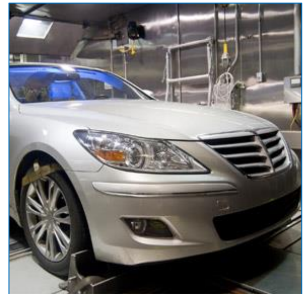
The Environmental Capable Chamber in the Vehicle Emissions Testing Laboratory at Delphi's Technical Center Rochester