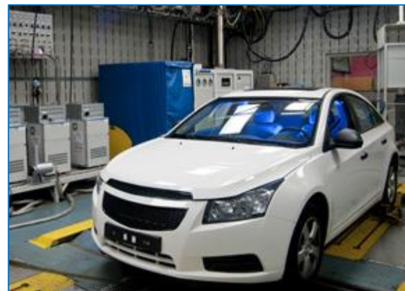
Typical set-up for the Vehicle Emissions Testing Laboratory at Delphi’s Technical Center Rochester

The Vehicle Emissions Testing Laboratory at the Delphi Technical Center Rochester (TCR) offers vehicle manufacturers and automotive component suppliers three state-of-the-art test chambers, including one with environmental capability for engine and exhaust aftertreatment development and regulatory compliance support. Real-time modal and tailpipe emissions data can be collected for the following requirements: